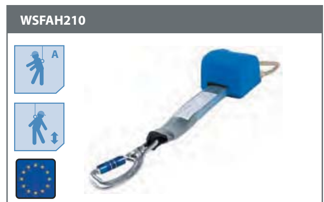
WORKSafe® Rolex Webbing Retractor AH210 with Twist-lock Karabiner & Swivel Snap Hook