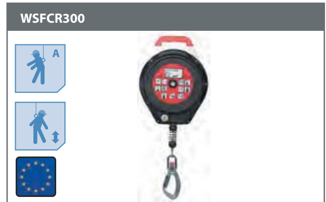
WORKSafe® CR 300 Steel Cable Retractor with Swivel Snap Hook & Fall Indicator.