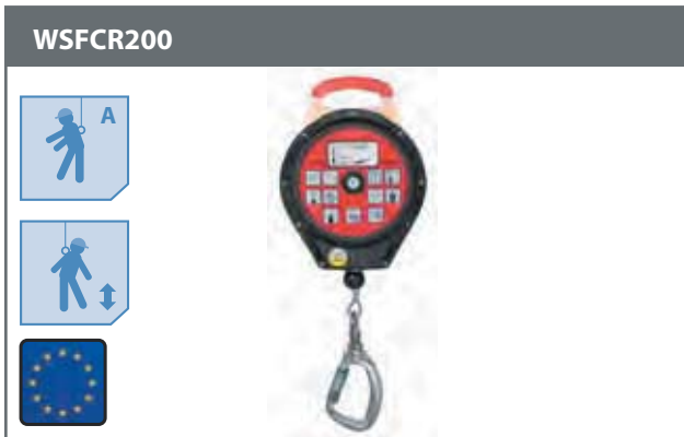
WORKSafe® CR 200 Steel Cable Retractor with Swivel Snap Hook & Fall Indicator.