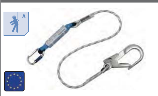
WORKSafe® Energy Absorber with Single Rope Safety Lanyard/(PSB Approved)