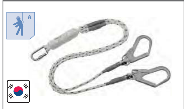
WORKSafe® Energy Absorber with Double Rope Safety Lanyard/(PSB Approved)