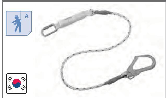
WORKSafe® Energy Absorber with Single Rope Safety Lanyard/(PSB Approved)