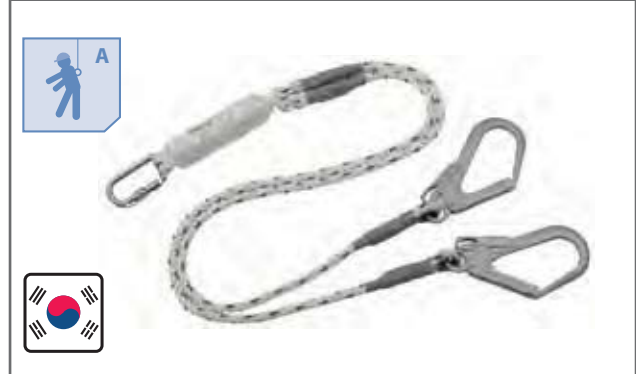
WORKSafe® Energy Absorber with Double Rope Safety Lanyard/(PSB Approved)