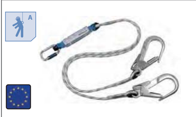
WORKSafe® Energy Absorber with Double Rope Safety Lanyard/(PSB Approved)