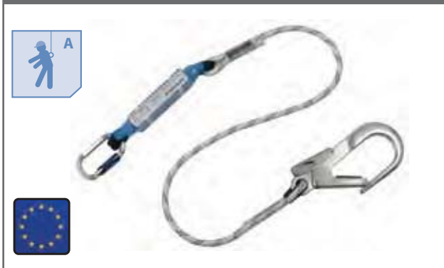
WORKSafe® Energy Absorber with Single Rope Safety Lanyard/(PSB Approved)