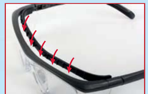
Wrap-around vented frame with detachable browguard for air ventilation and optimum protection