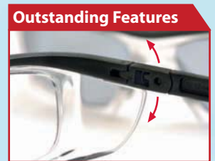
Outstanding Features Adjustable temple inclination with integrated side protection for comfort fit on varied facial profiles